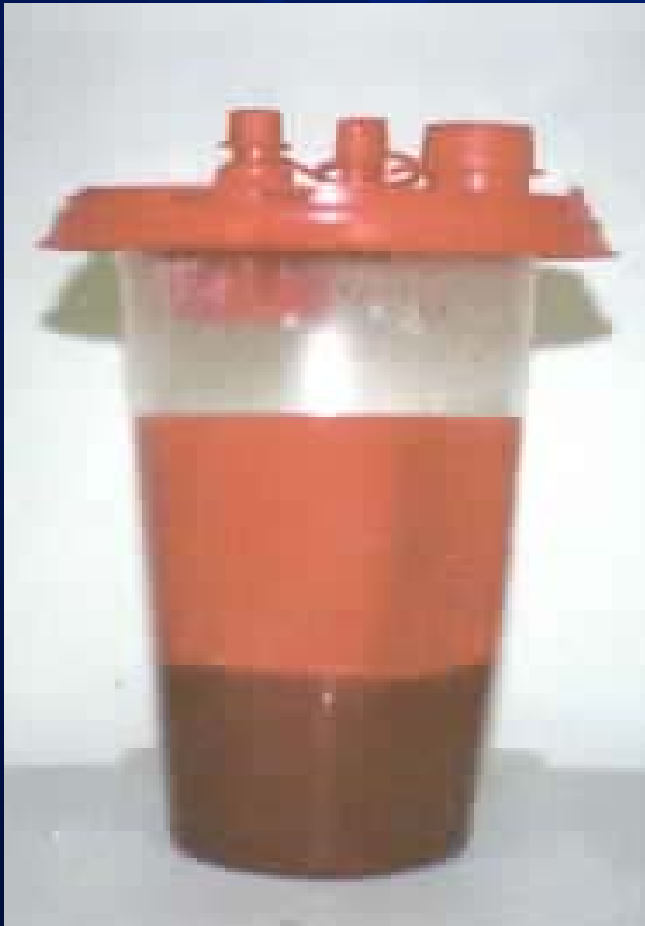
Old Liposuction Technology