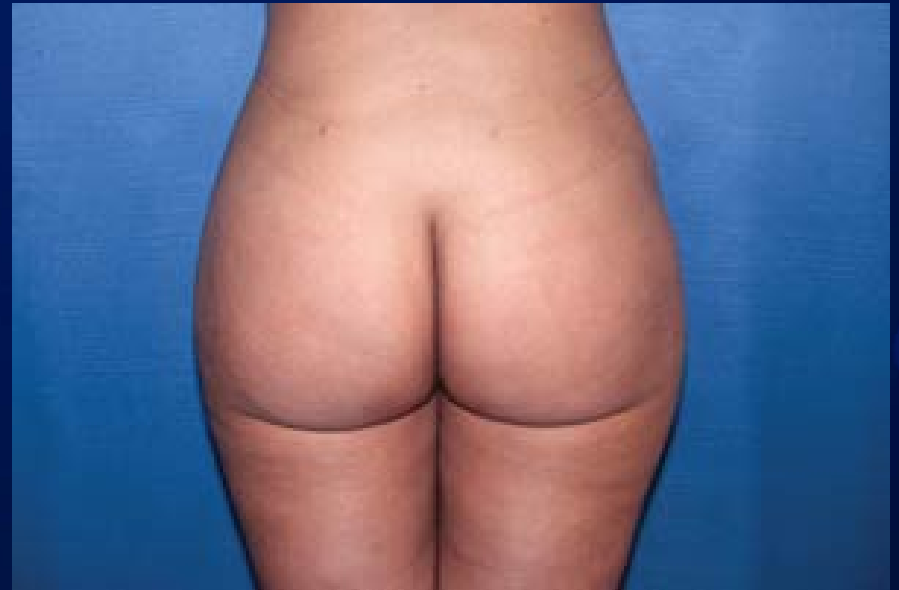
After 2 Vaser Treatments