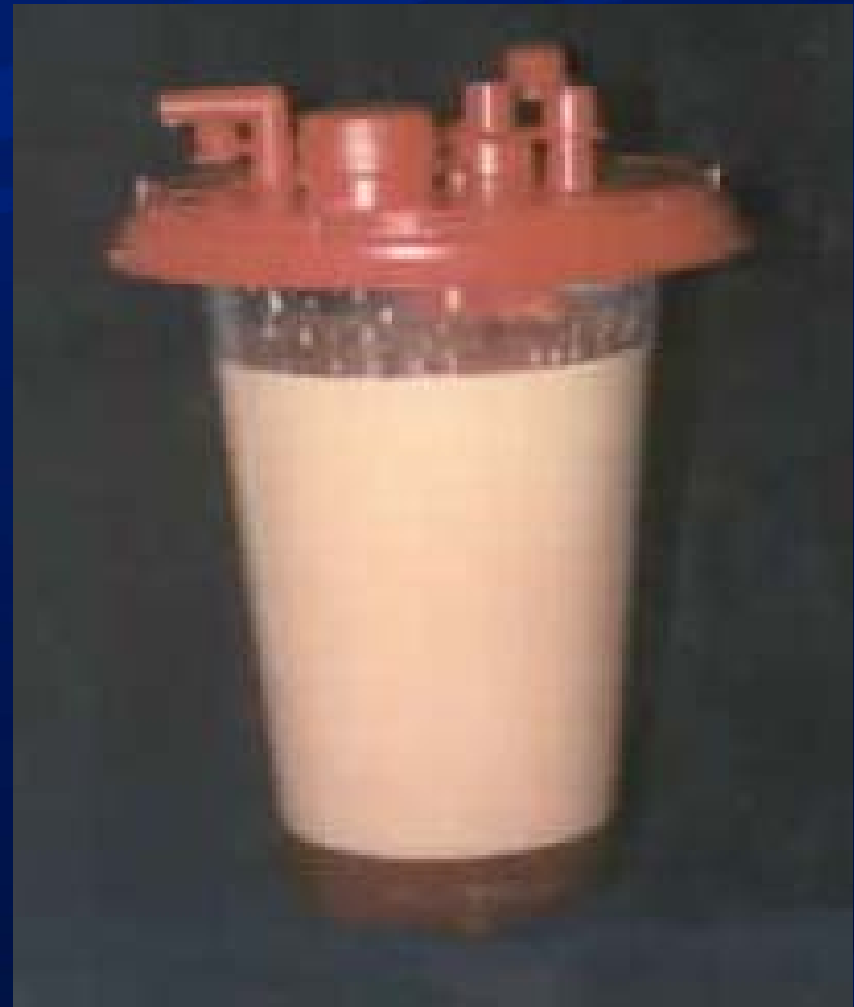
New VASER Technology