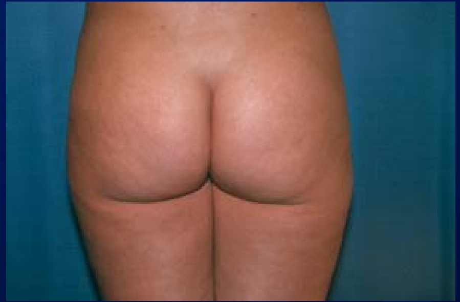
After 2 Vaser Treatments